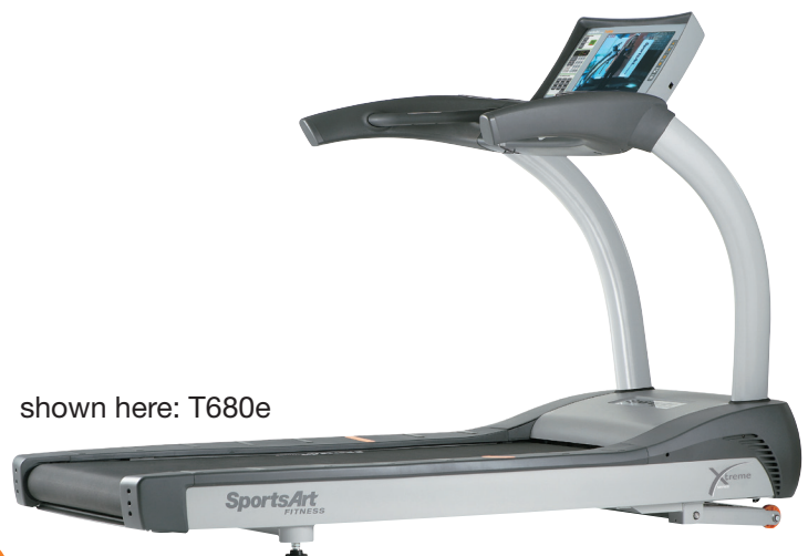
shown here: T680e